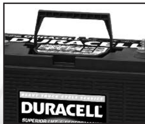
Convenient handles or lifting ledges, on most models, significantly enhance transportation and installation of heavy-duty commercial batteries.