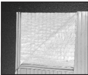
Cycle service batteries have special fiberglass mats to improve deep cycling and long-life performance.